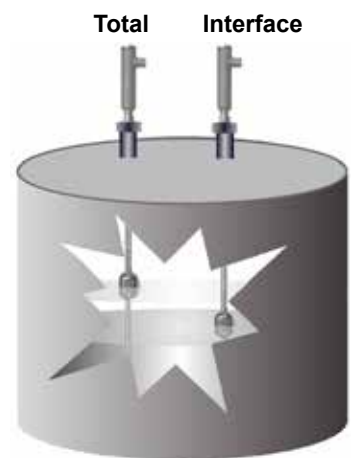
AT500 Sample Applications Total and Interface Measure- ment